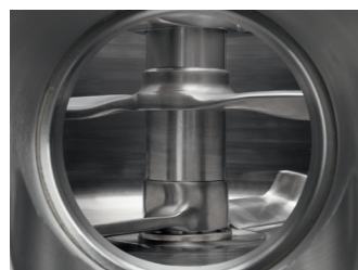
Modular mixing tool configuration