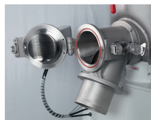
Easy to clean